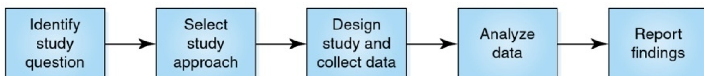
FIGURE 1-1 The Research Process

Health research examines a broad spectrum of biological, socioeconomic, environmental, and other factors that contribute to the presence or absence of physical, mental, and social health and well-being. Population health research